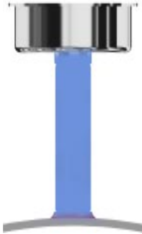
Coating Bare Risers